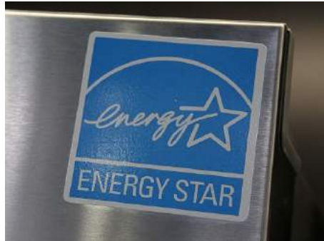
ENERGY STAR Label