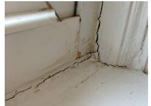
Example of Window Frame Cracks