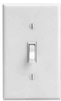
Manual Light Switch