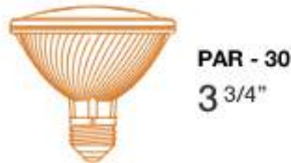
PAR - 30 3 3/4"