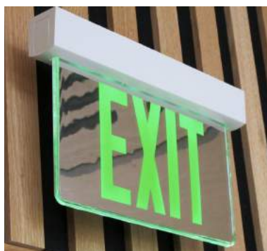
LED Exit Sign