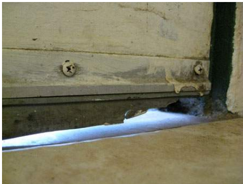
Weather Striping - Bad Condition