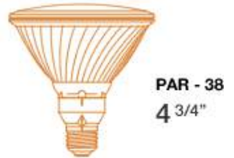
PAR - 38 4 3/4"