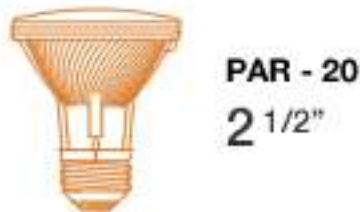
PAR - 20 2 1/2"