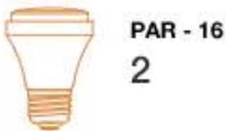
PAR - 16 2