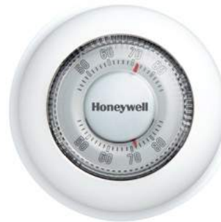
Examples of Non-Programmable Thermostats