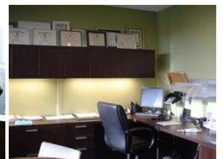
Examples of Task Lighting