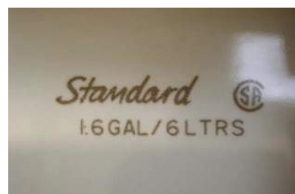
Toilet GPF Label