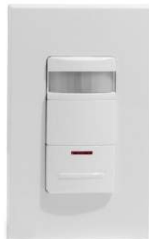
Occupancy Sensor Light Switch