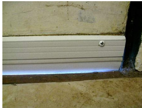
Weather Striping - Good Condition