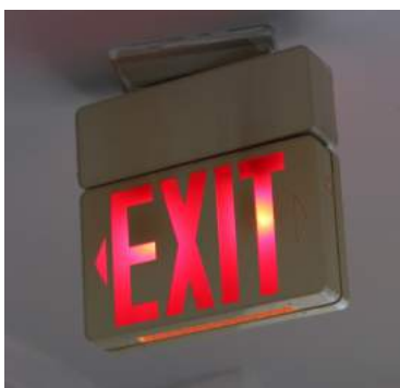
Non-LED Exit Sign